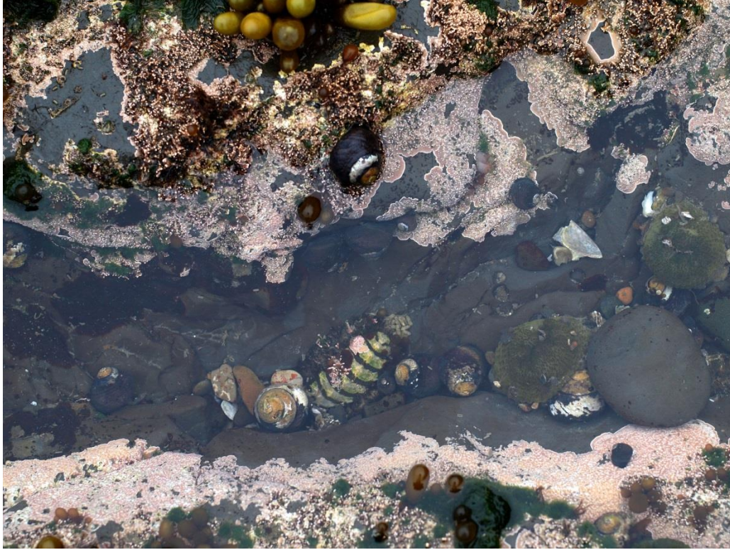
Black Tegula snails surround a mossy chiton in a tidepool at Fitzgerald Marine Reserve

Belatedly by 20 years, I found myself ankle-deep in a tidepool wondering about sea snails. Tegula snails are perhaps the most ignorable animals in the West Coast's intertidal life riot. But once you start to pluck at that seemingly pedestrian thread it leads you up and out and away until suddenly you've unraveled a whole damned sweater. "Go down to the shore and poke around," urges the preface to the 704-page Encyclopedia of Tidepools & Rocky Shores . "Undoubtedly, questions will rapidly spring to mind. At first they may be specific and small-scale. What species is that snail? ... But small questions lead to larger ones."