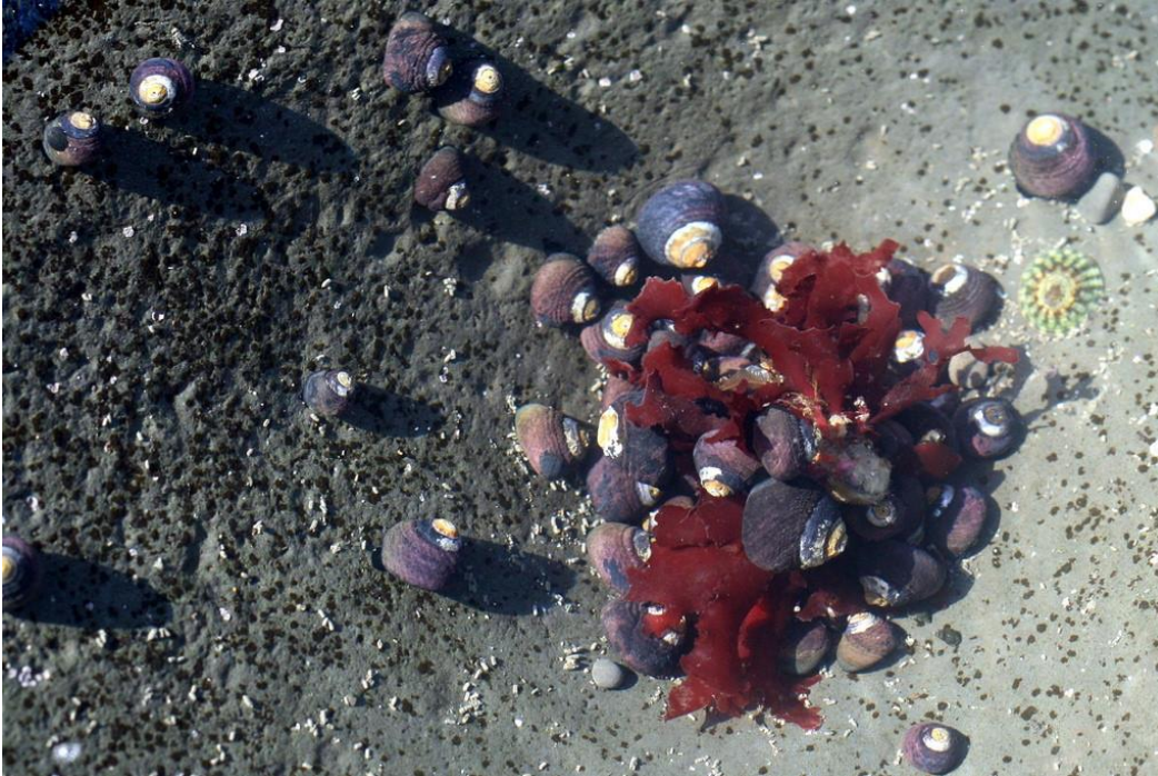
A group of black Tegula

adventurous Tegula tend to meet up with passive sea stars, while passive Tegula tend to meet up with adventurous sea stars. Taken together the personalities of snails and sea stars matter in determining what's where in a tidepool. Pruitt elaborated on this in a second paper in The American Naturalist in March 2017, in which he laid out the worst-case scenario for a Tegula community: a diverse group of sea stars moves in like a dragnet, and the snails can't escape no matter what course of action they choose.