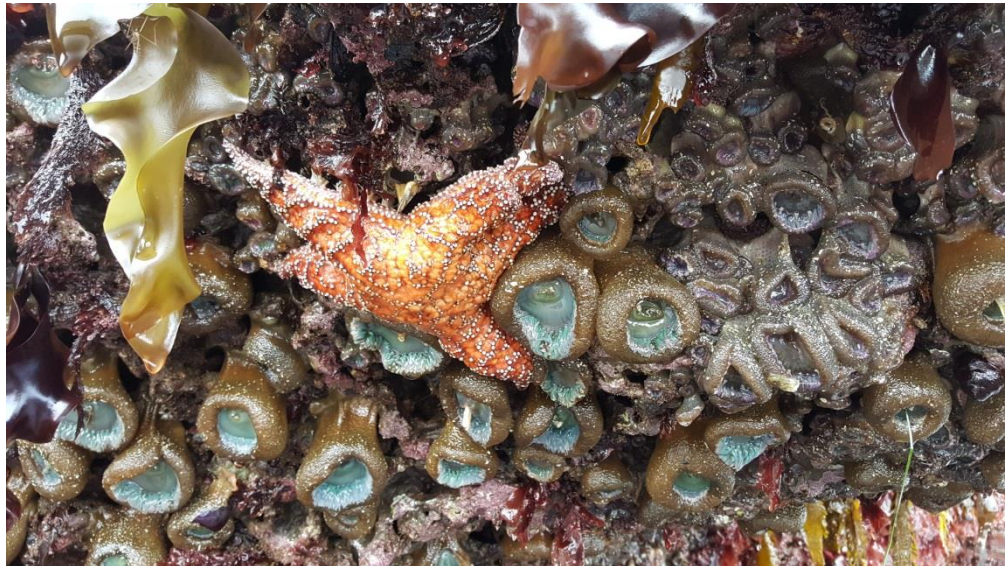
Pisaster ochraceus , the legendary ochre sea star

Then nature knocked down the scaffolding.