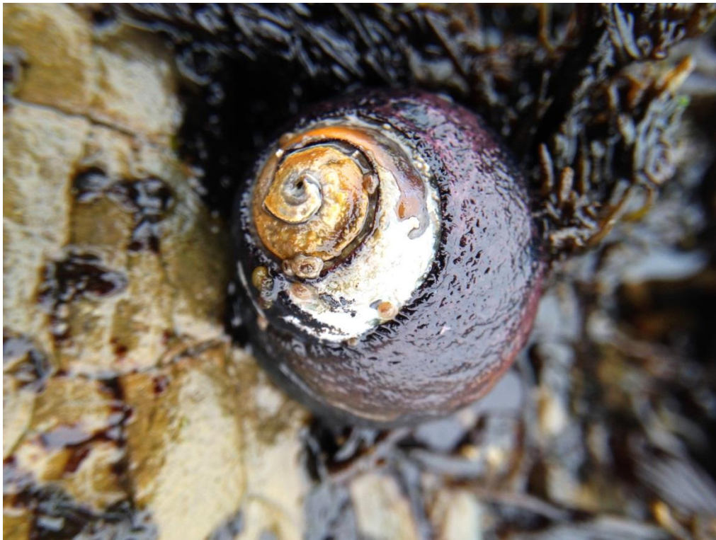
Black Tegula ( Tegula funebris)

Paine then turned his attention to snails. He had noticed that young, small black Tegula snails lived in the shallows, while old, large snails moved deeper down. At some point not too far into the zone of overlap with ochre sea stars black Tegula all but cease to exist, and it was Paine's idea that this was because sea stars were eating them.