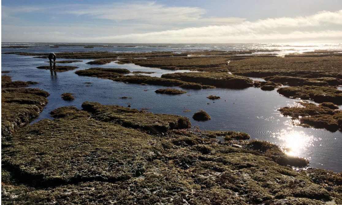
A tidepooler peers into the universe at Fitzgerald Marine Reserve.