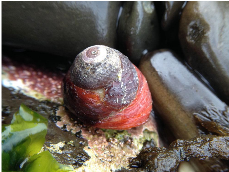
The “rainbow shell” of a brown Tegula ( Tegula brunnea)