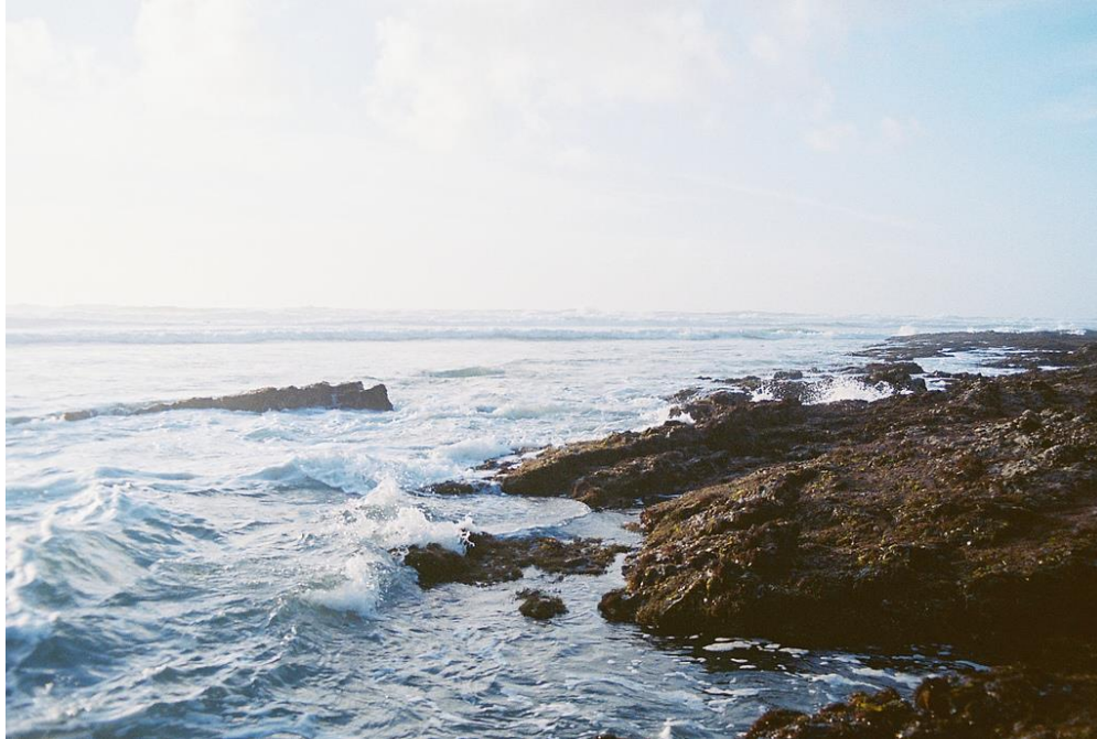
The rocky edge of the Pacific at Fitzgerald Marine Reserve