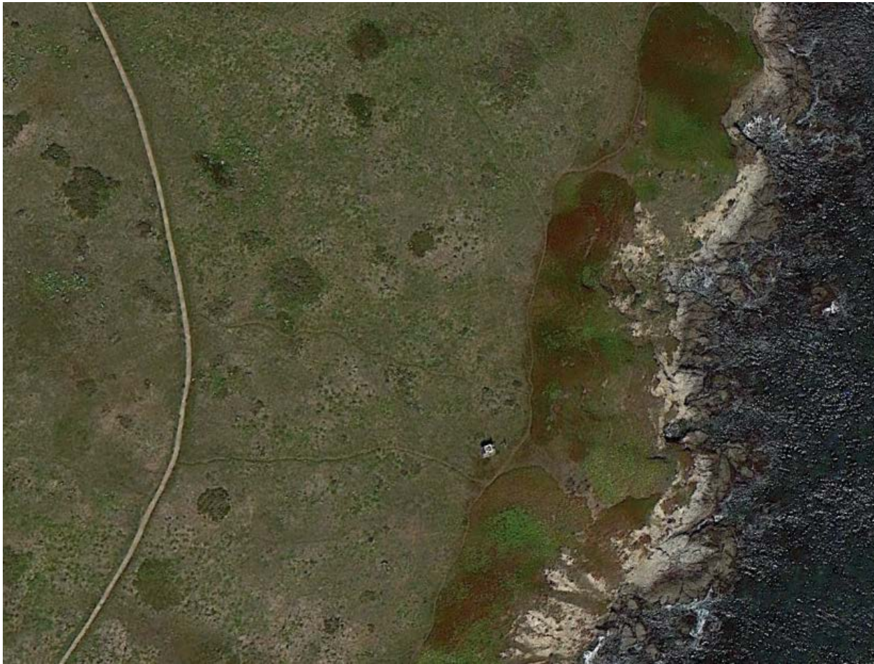
Figure 11 Vantage and Beacon points on southern Bodega Head from the improved main trail.