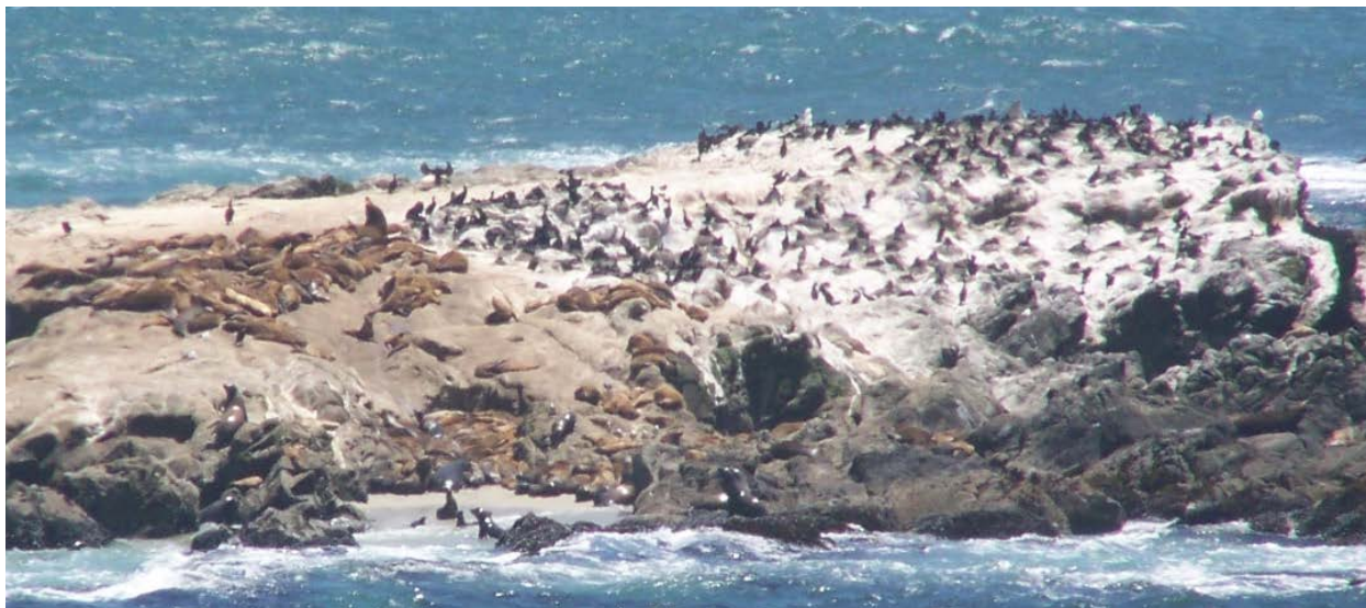
Figure 8 Brant's Cormorant's Colony on Bodega Rock 5/6/2012