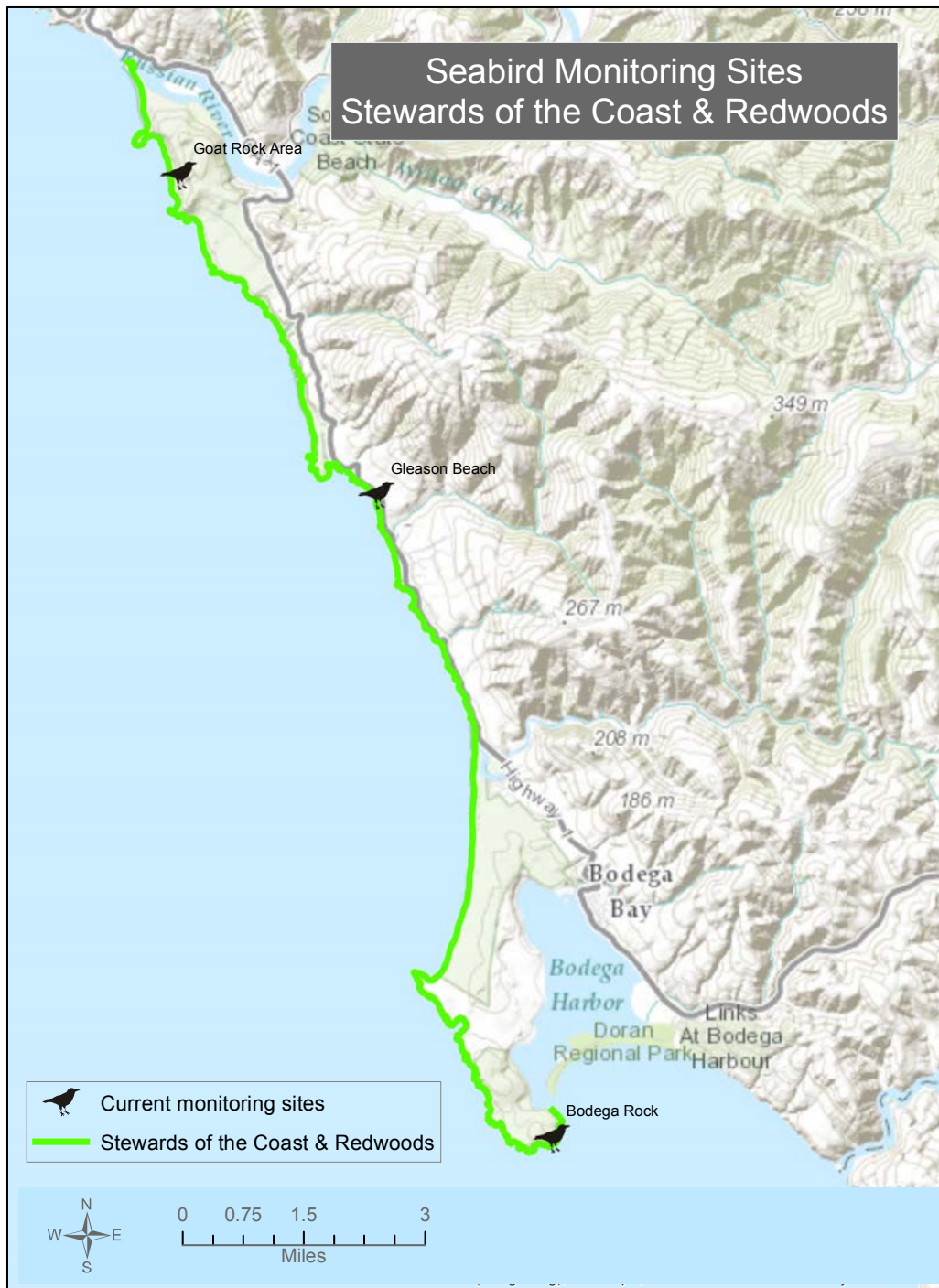
Figure 1 Map of Stewards study area, California