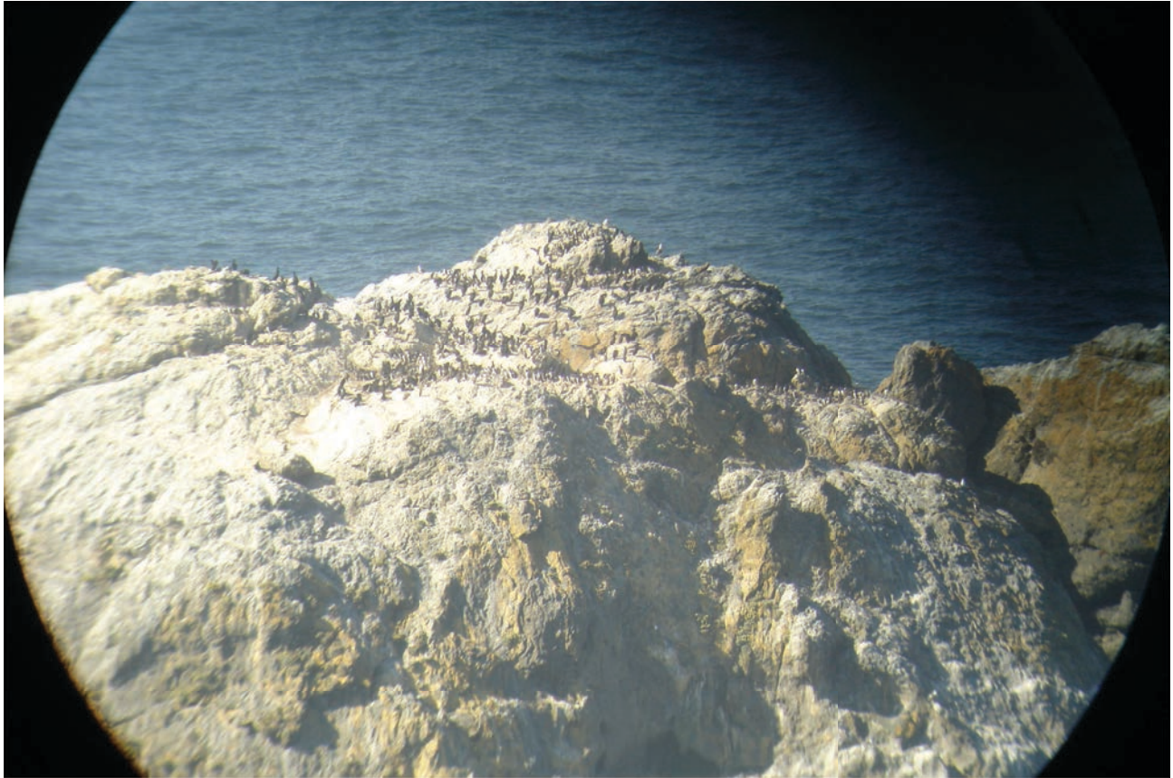
Figure 6 Gull Rock Vantage Point from Sunset Rock